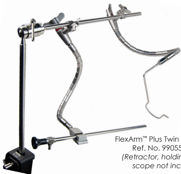
FlexArm™ Plus Twin Arm System Ref. No. 99055-QCLR (Retractor, holding tip and scope not included)

Specially designed with hex post fitting for direct attachment to Mediflex® Holding & Positioning Systems - for maximum retraction security and stability